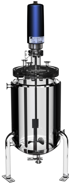
Example, AQ Dynamic Mixer mounted on a glass tank.